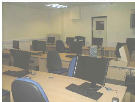
Learning Centre with 16 PCs located within Bentilee Jet

All the Jet centres are located within communities as the Jet project is designed to help improve communities.