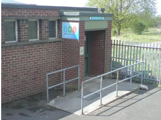
Entrance to the Bentilee Jet Office