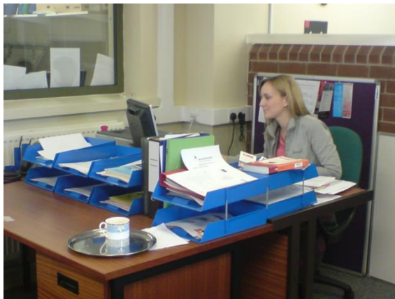
Partnership working – Smart Moves team located within Bentilee Jet