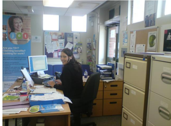
Bentilee Jet reception